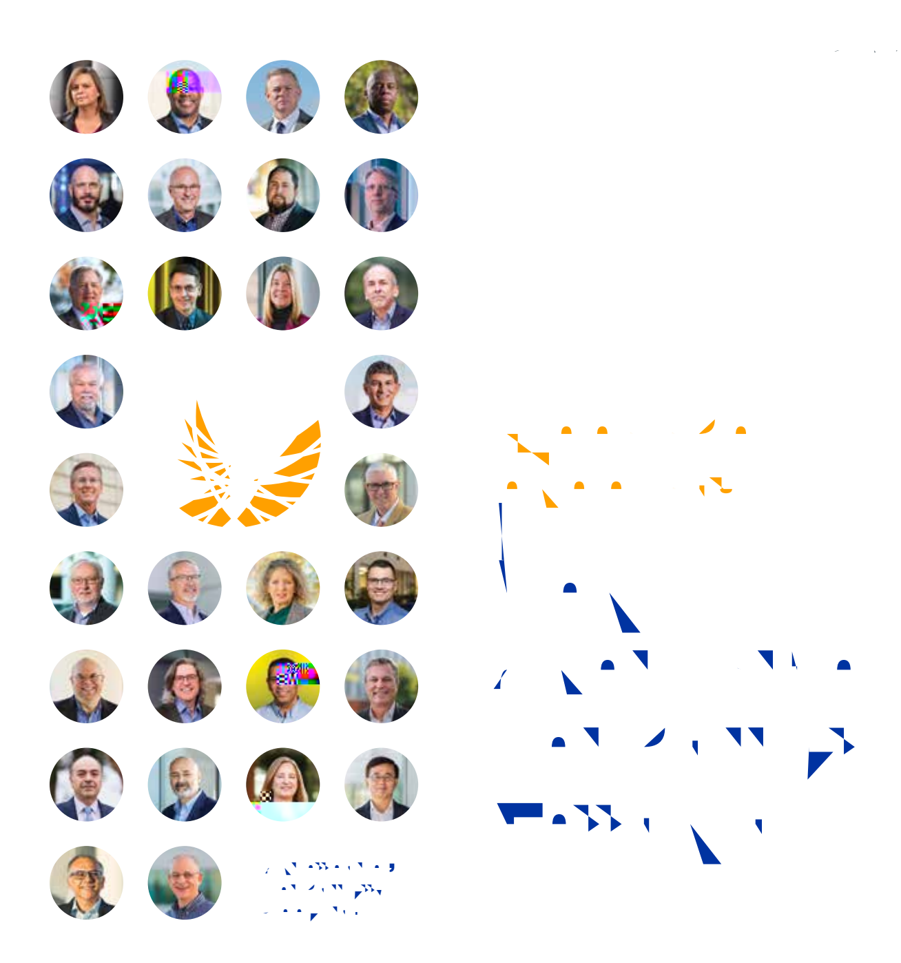
nn.n , u.... , ... , ... , ... , ... , ... , ... , ... , ... , ... , ... , ... , ... , ... , ... , ... , ... , ... , ... , ... , ... , ... , ... , ... , ... , ... , ... , ... , ... , ... , ... , ... , ... , ... , ... , ... , ... , ... , ... , ... , ... , ... , ... , ... , ... , ... , ... , ... , ... , ... , ... , ... , ... , ... , ... , ... , ... , ... , ... , ... , ... , ... , ... , ... , ... , ... , ... , ... , ... , ... , ... , ... , ... , ... , ... , ... , ... , ... , ... , ... , ... , ... , ... , ... , ... , ... , ... , ... , ... , ... , ... , ... , ... , ... , ... , ... , ... , ... , ... , ... , ... , ... , ... , ... , ... , ... , ... , ... , ... , ... , ... , ... , ... , ... , ... , ... , ... , ... , ... , ... , ... , ... , ... , ... , ... , ... , ... , ... , ... , ... , ... , ... , ... , ... , ... , ... , ... , ... , ... , ... , ... , ... , ... , ... , ... , ... , ... , ... , ... , ... , ... , ... , ... , ... , ... , ... , ... , ... , ... , ... , ... , ... , ... , ... , ... , ... , ... , ... , ... , ... , ... , ... , ... , ... , ... , ... , ... , ... , ... , ... , ... , ... , ... , ... , ... , ... , ... , ... , ... , ... , ... , ... , ... , ... , ... , ... , ... , ... , ... , ... , ... , ... , ... , ... , ... , ... , ... , ... , ... , ... , ... , ... , ... , ... , ... , ... , ... , ... , ... , ... , ... , ... , ... , ... , ... , ... , ... , ... , ... , ... , ... , ... , ... , ... , ... , ... , ... , ... , ... , ... , ... , ... , ... , ... , ... , ... , ... , ... , ... , ... , ... , ... , ... , ... , ... , ... , ... , ... , ... , ... , ... , ... , ... , ... , ... , ... , ... , ... , ... , ... , ... , ... , ... , ... , ... , ... , ... , ... , ... , ... , ... , ... , ... , ... , ... , ... , ... , ... , ... , ... , ... , ... , ... , ... , ... , ... , ... , ... , ... , ... , ... , ... , ... , ... , ... , ... , ... , ... , ... , ... , ... , ... , ... , ... , ... , ... , ... , ... , ... , ... , ... , ... , ... , ... , ... , ... , ... , ... , ... , ... , ... , ... , ... , ... , ... , ... , ... , ... , ... , ...